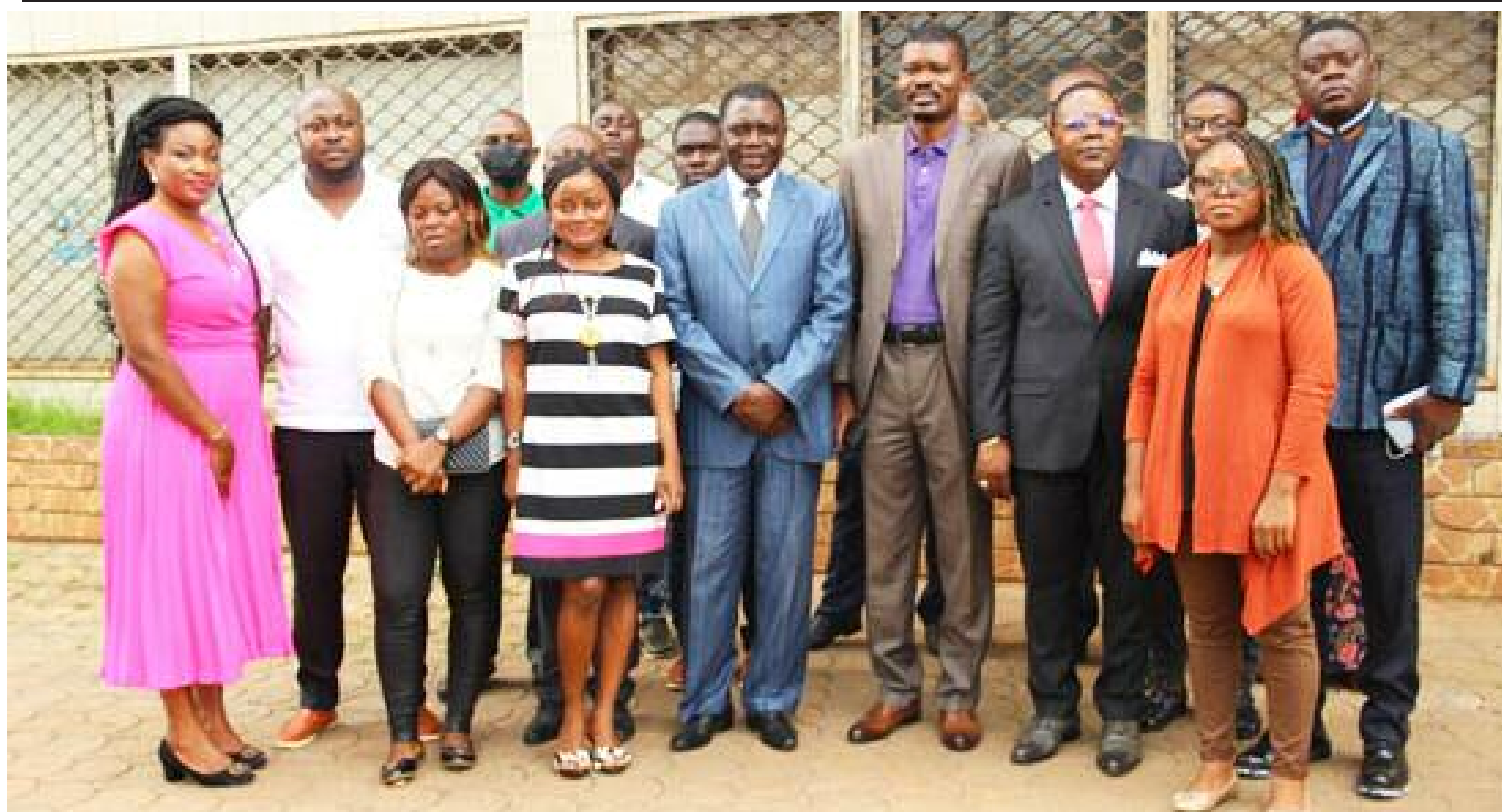
NCC delegation, Mutation newspaper staff in group photo

he urged, before adding that "if the profession in Cameroon has to survive, it will be thanks to you and me, by making a difference to what is said on social media and on what is written on paper".