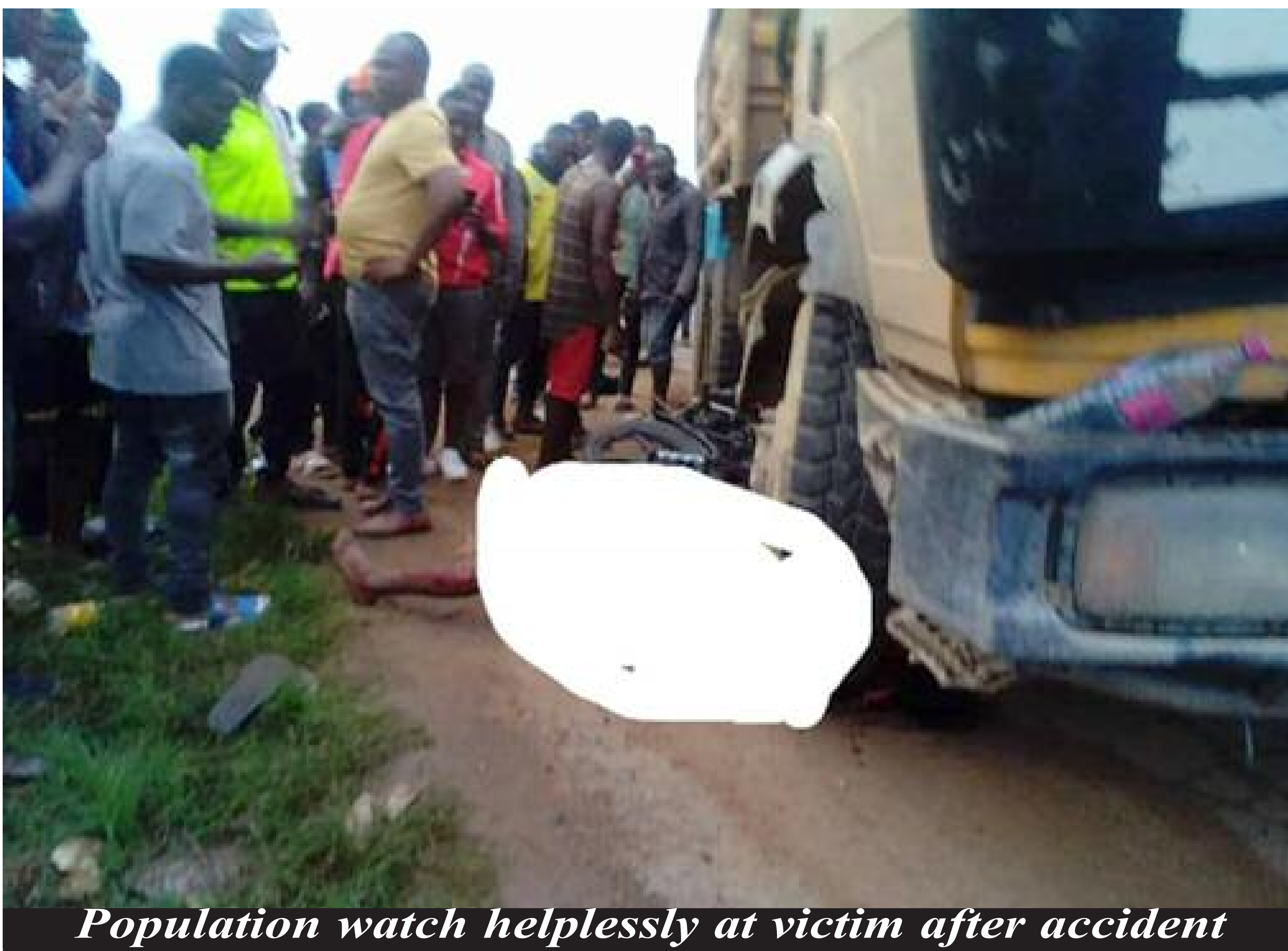
Population watch helplessly at victim after accident

The driver is said to have been arrested and his truck impounded pending investigations.