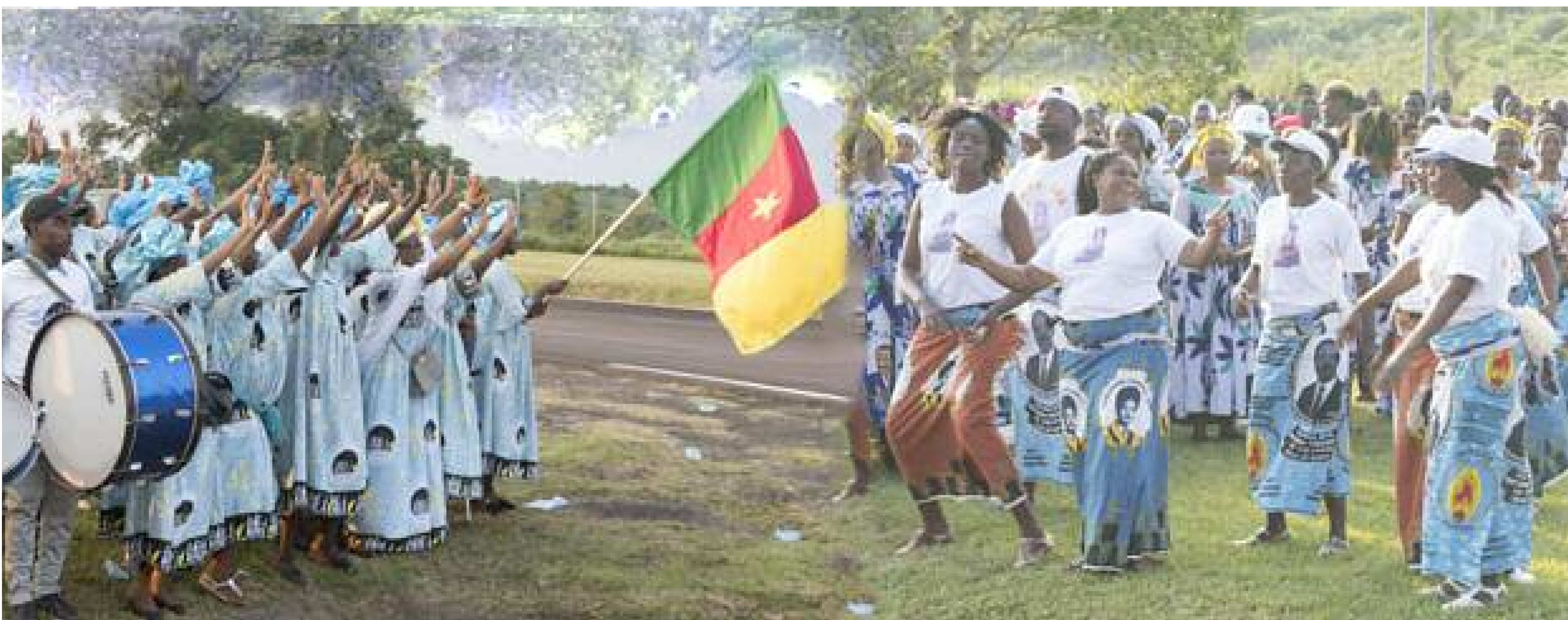
File photo: The ambiance that usually welcomes President Biya back to the country, failed to take place yesterday