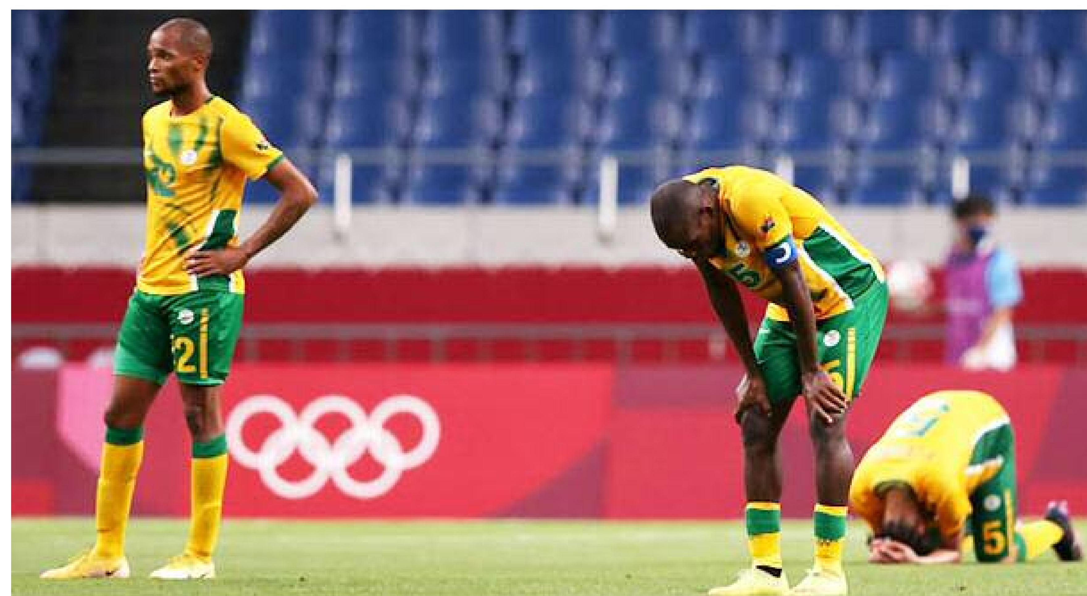
South African U-23 players looking dejected after defeat to France

Andre-Pierre Gignac scored a second-half hat-trick as France came from behind three times to beat South Africa 4-3 and keep their Olympic hopes alive. Having lost their Group A opener, France looked to be heading out until former Marseille striker Gignac completed his treble from the penalty spot to level for a third time on 85 minutes, before Teji Savanier grabbed an injury-time winner.