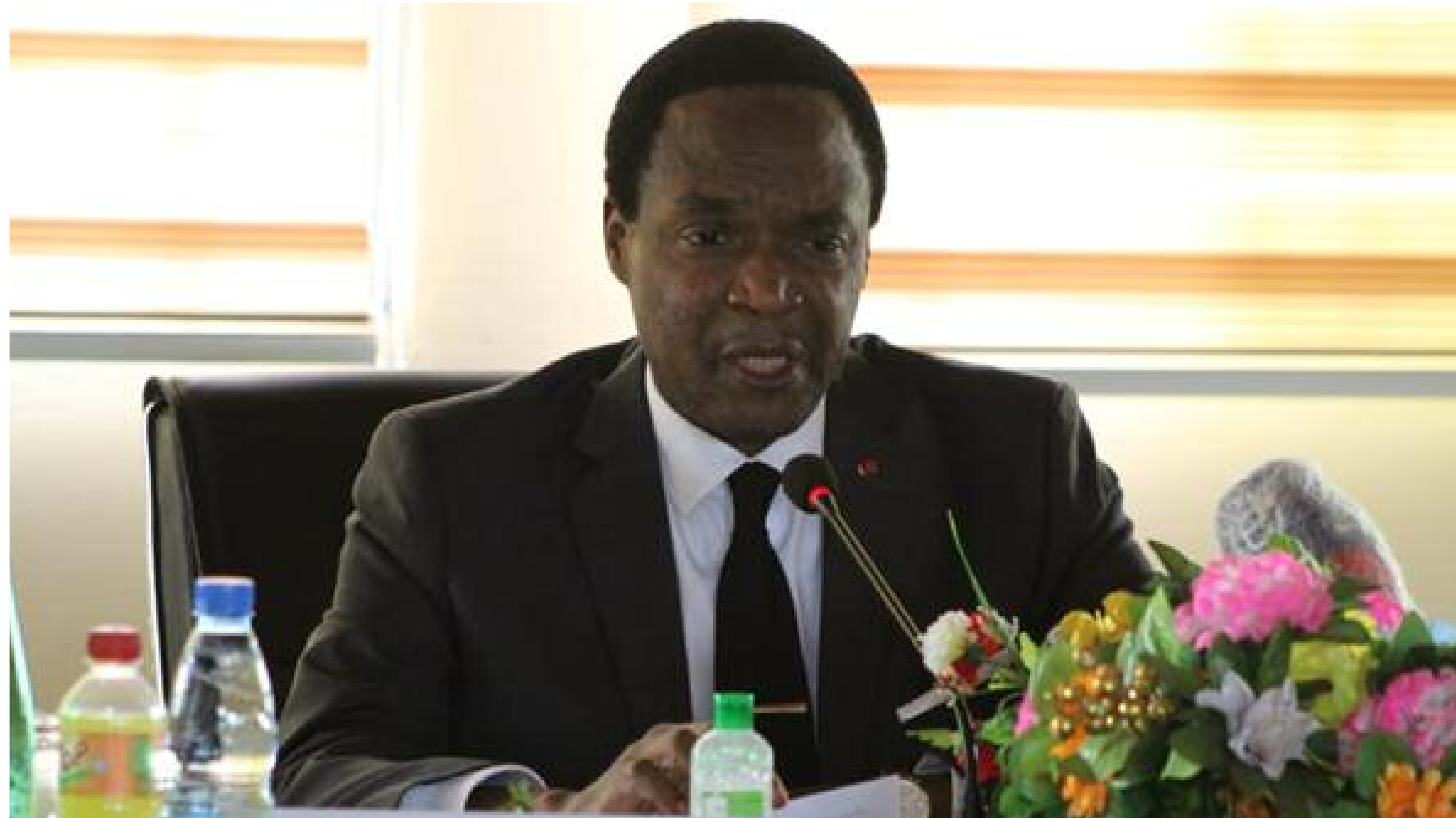
Minister Assomo chairing security meeting in Mbouda