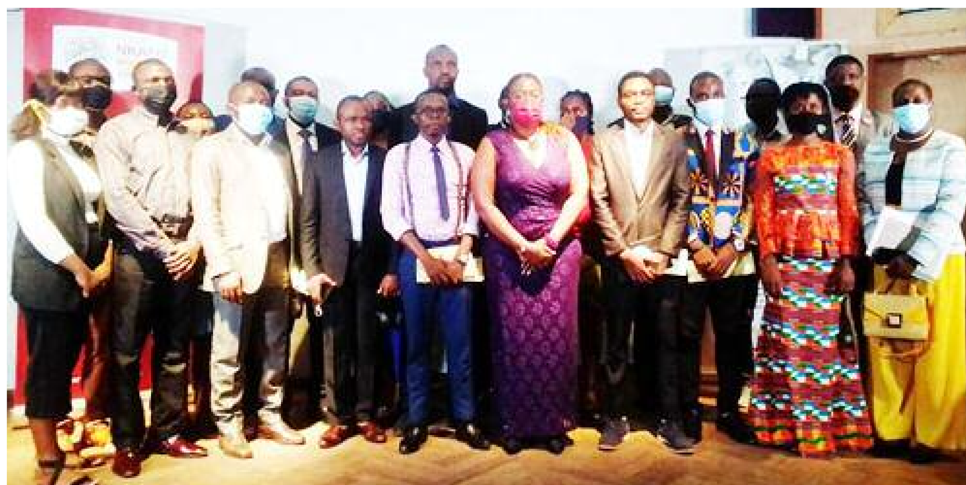
Organisers, panellists, participants in group photo

accounts and therefore they cannot access credits. If you don't ...so financial exclusion is the first challenge. They also have the problem of collateral.