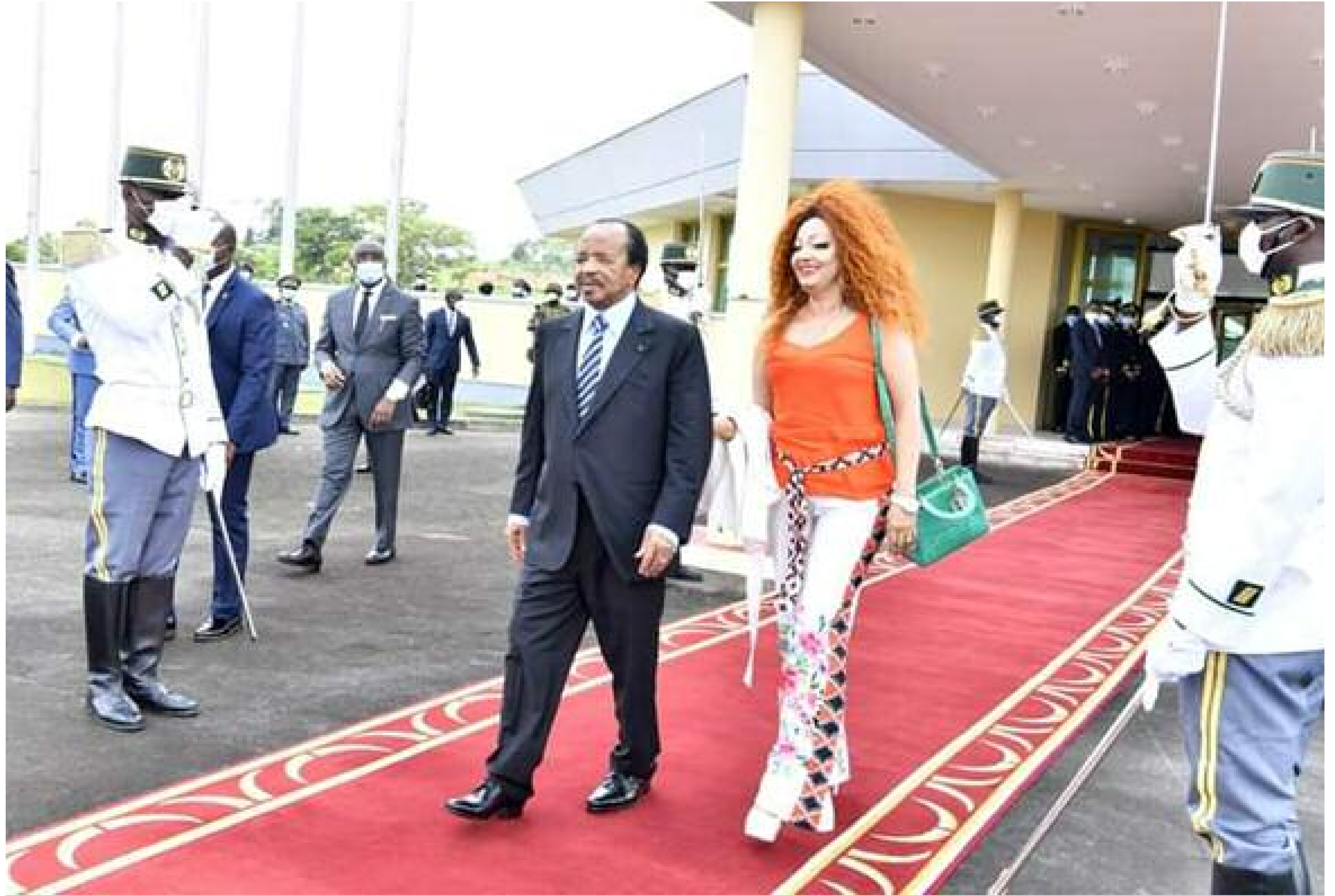
File photo: Biya, wife leaving the country for Europe Sunday June 11, 2021

Some members of the public have interpreted the development to mean Biya in his usual unpredictable manner remains the master of his own program and agen-