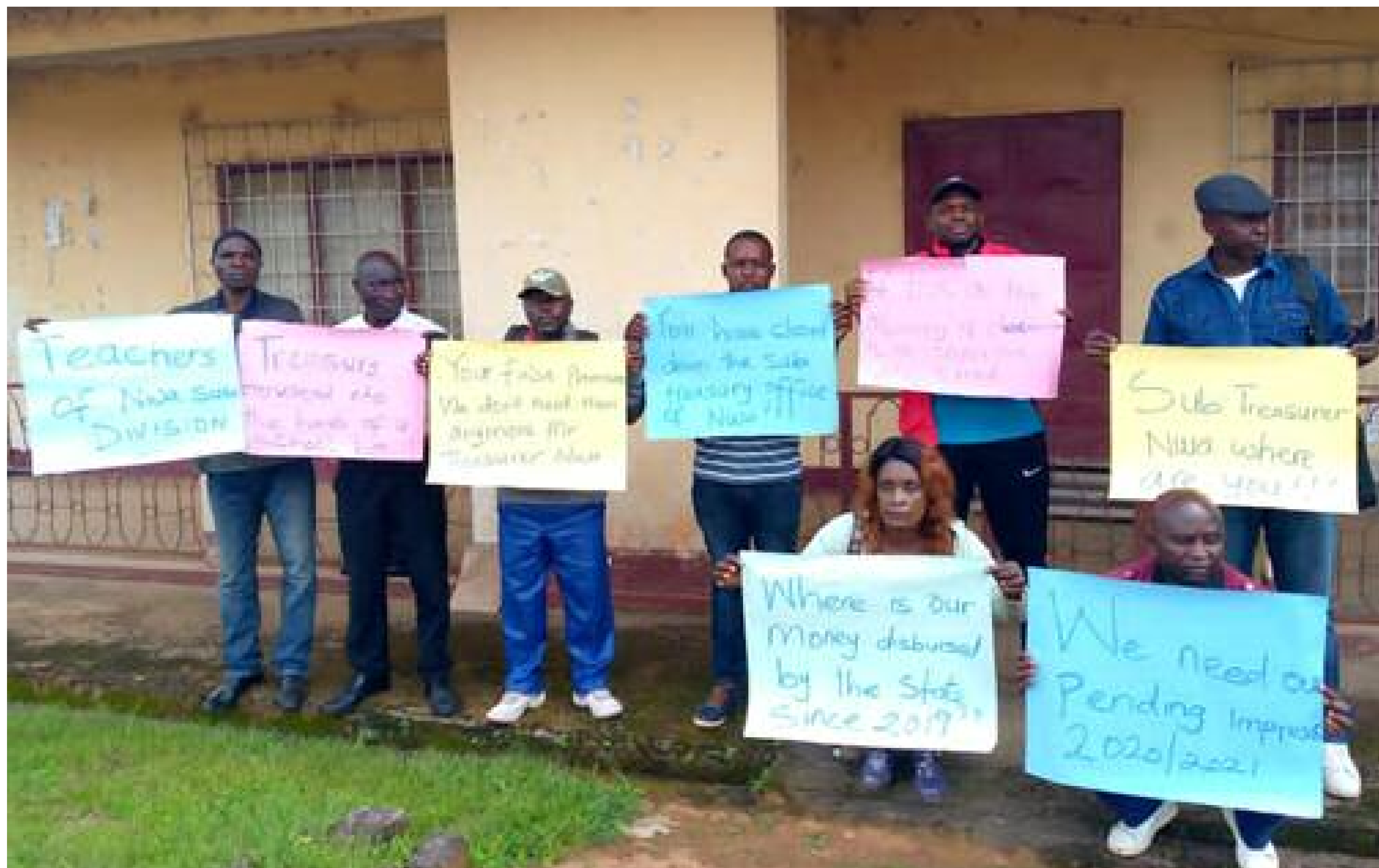
Some head teachers protesting at Nwa Sub Treasury

The official explained that: "What is clear is that, the money that was sent, the