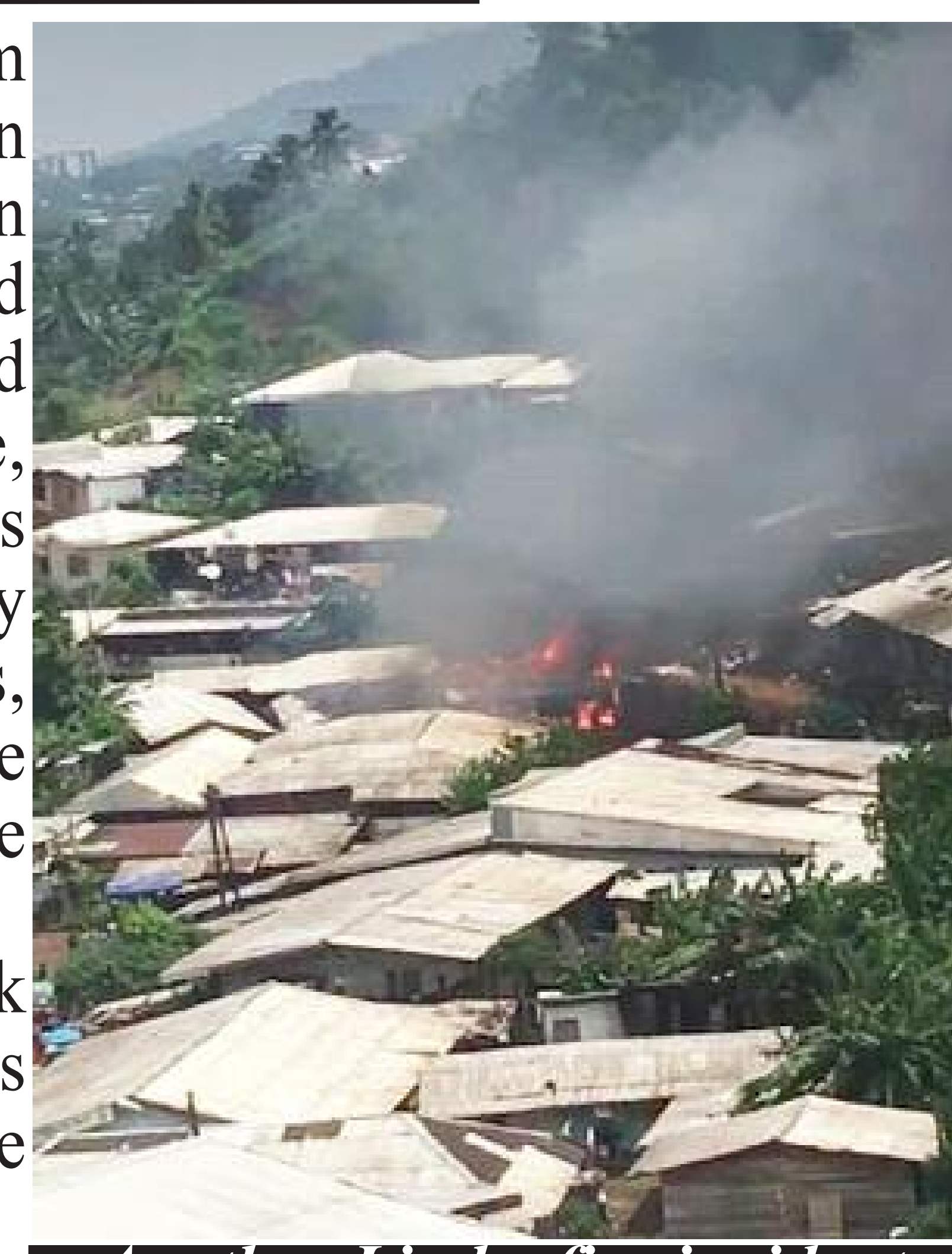
Another Limbe fire incident incurs much material damage

Fire incidents in the city of Limbe are not new, their sources usually unknown!