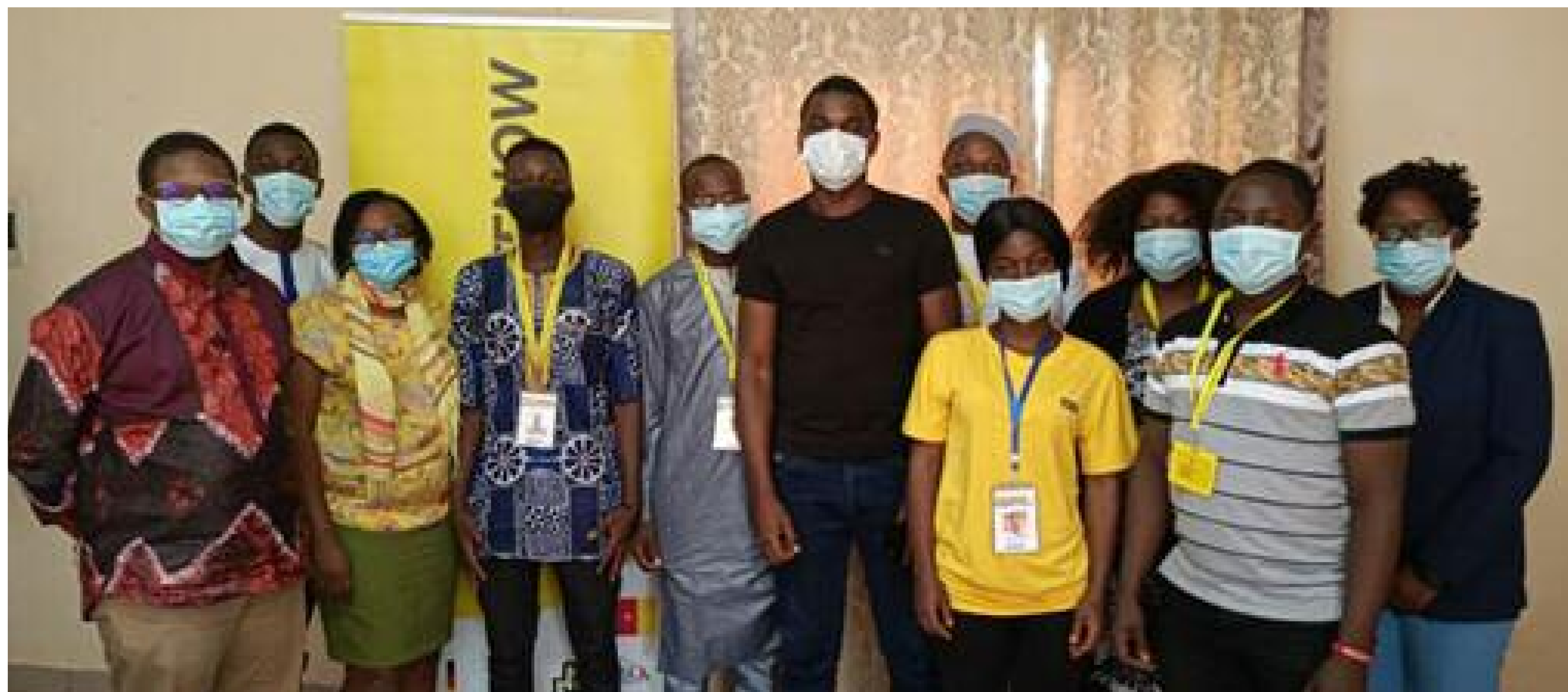
Fellows with trainers, coordinators