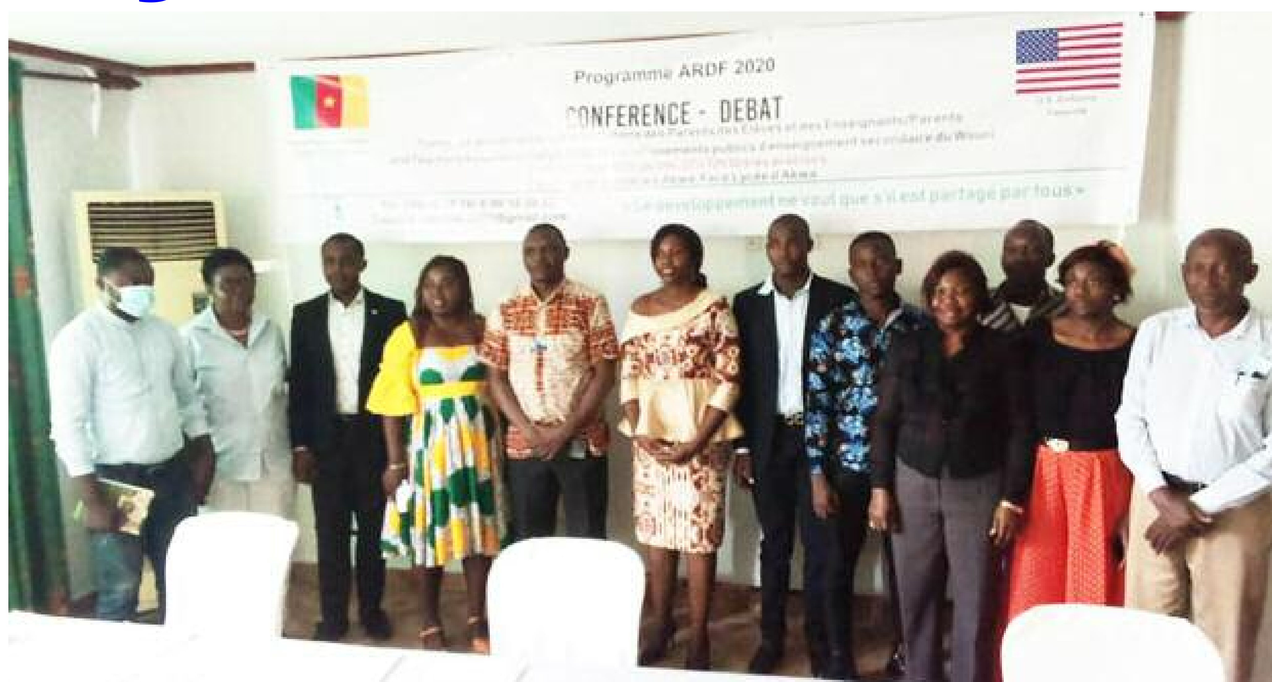
PTA representatives, CSOs, media men and women after debate in Douala

In 2005, the Ministry of Social Affairs,