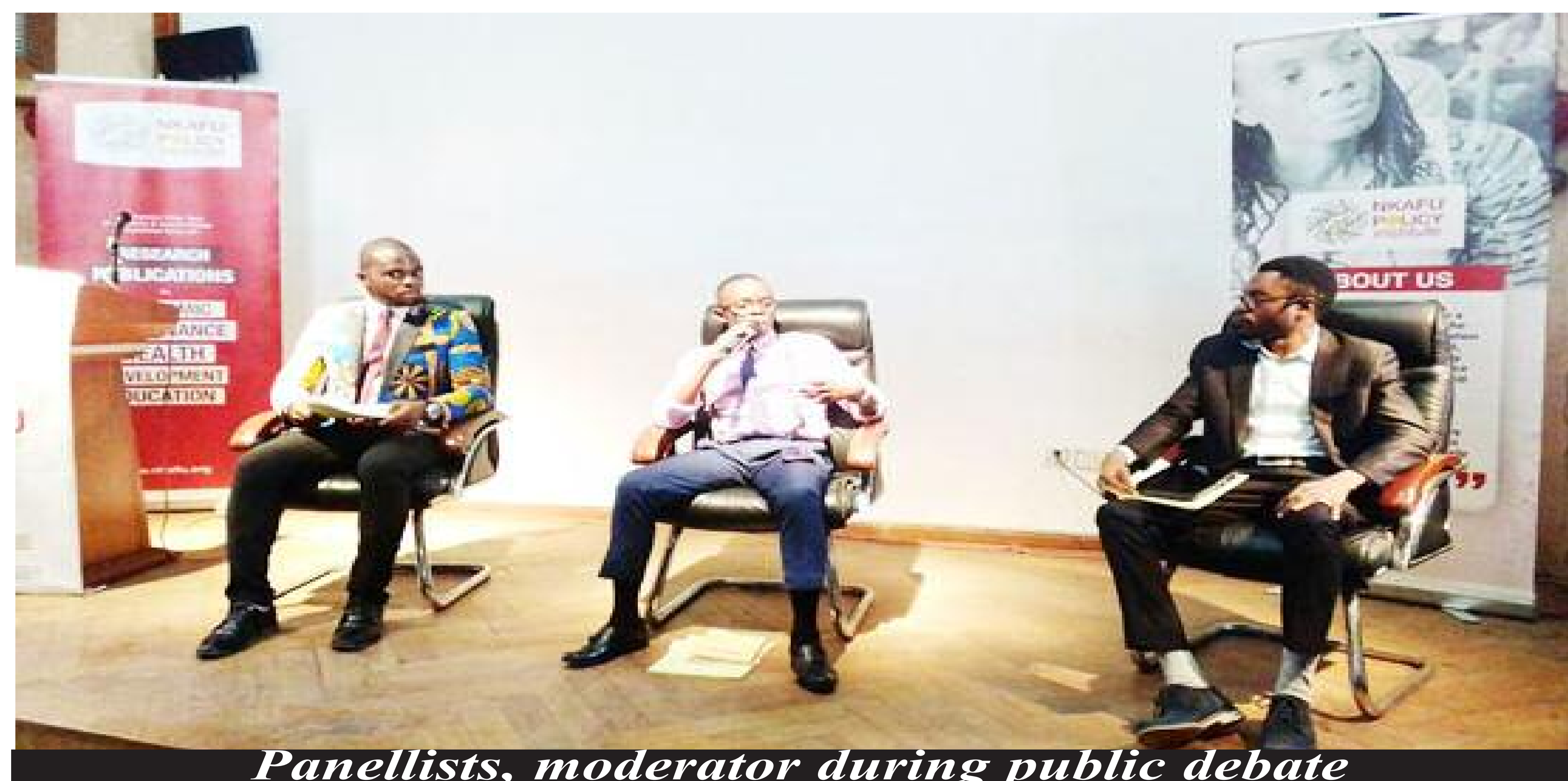
Panellists, moderator during public debate

Some of the difficulties these entrepreneurs have is that they don't have a bank