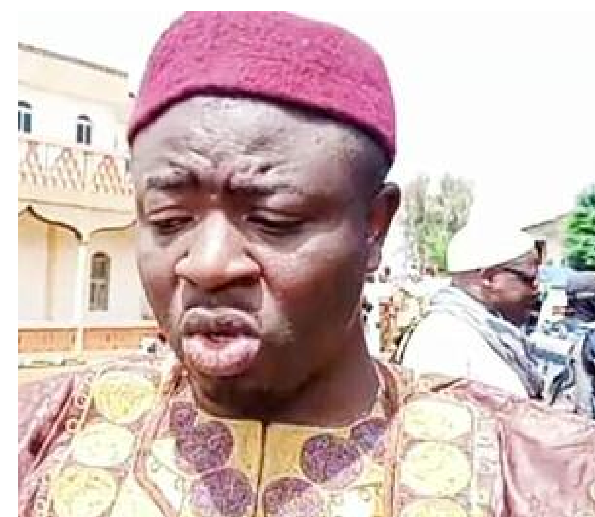
Interim Jakiri DO