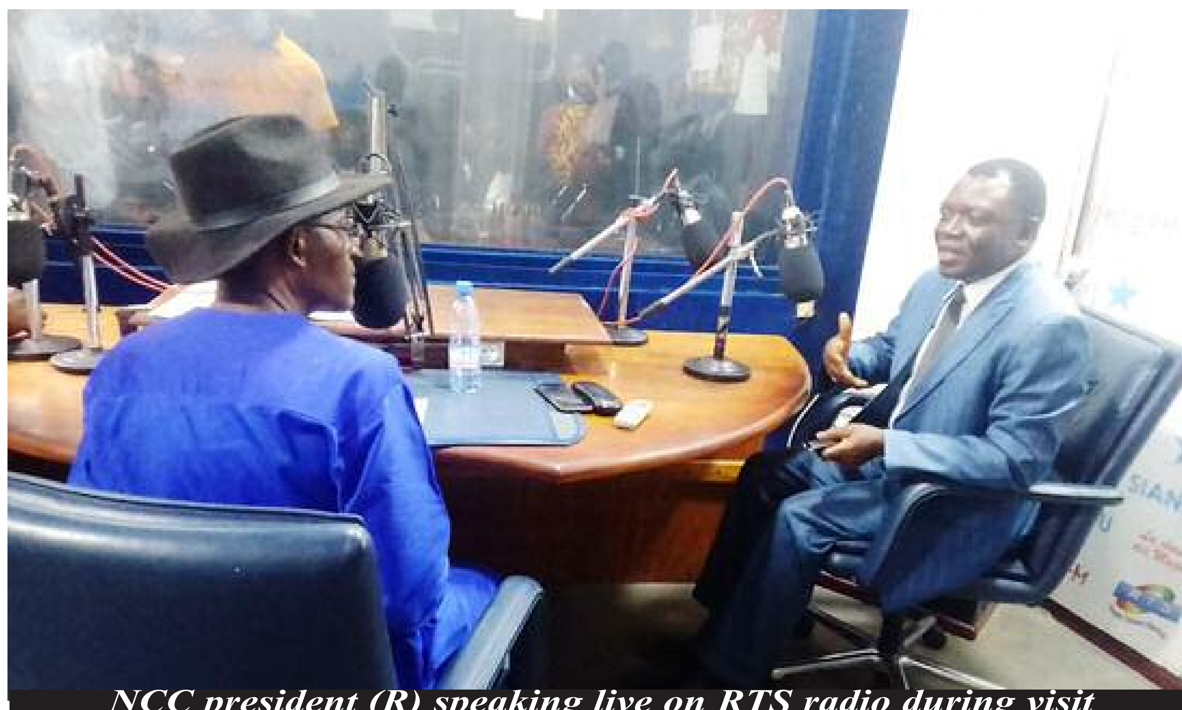
NCC president (R) speaking live on RTS radio during visit

"You can go to the social media to know what is happening but you must investigate the story, that's the challenge for professional journalists today. And do not be carried away by the sensation of the social media"