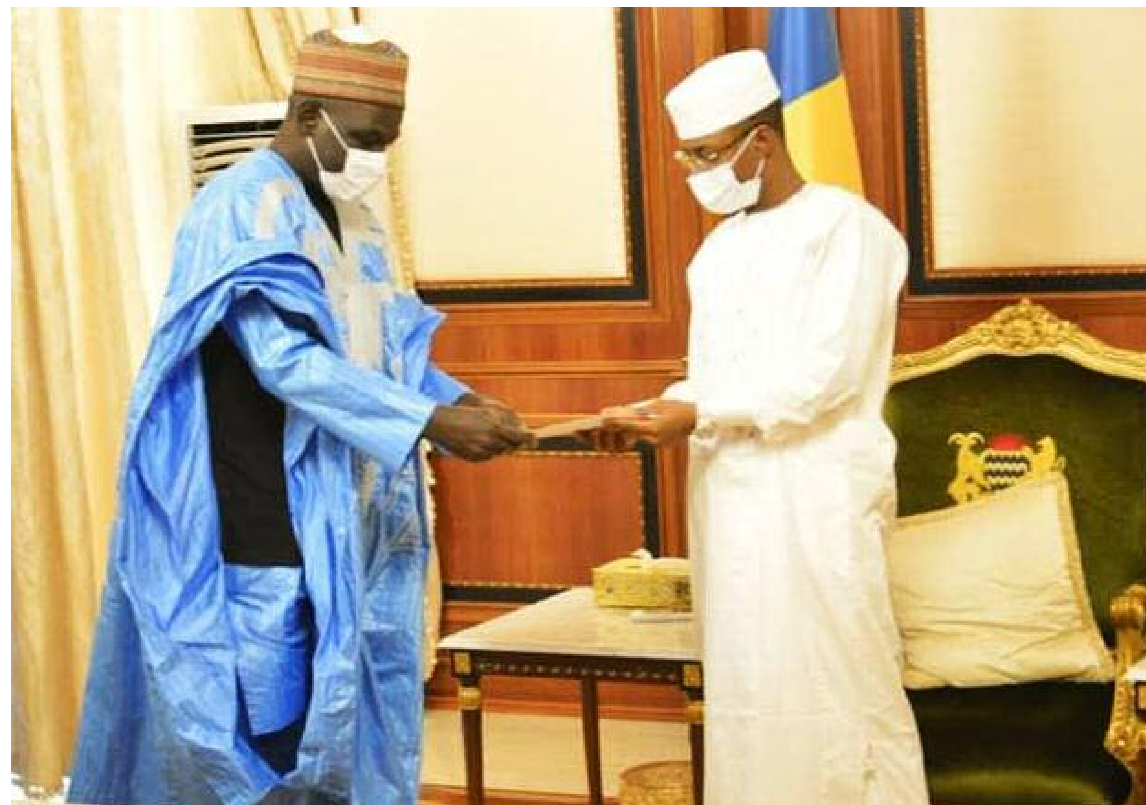
Minister Ousmane Mey handing sealed message to President Mahamat Idriss Deby Itno

According to the eminent officials, the two countries are presently witnessing the full impact of economic