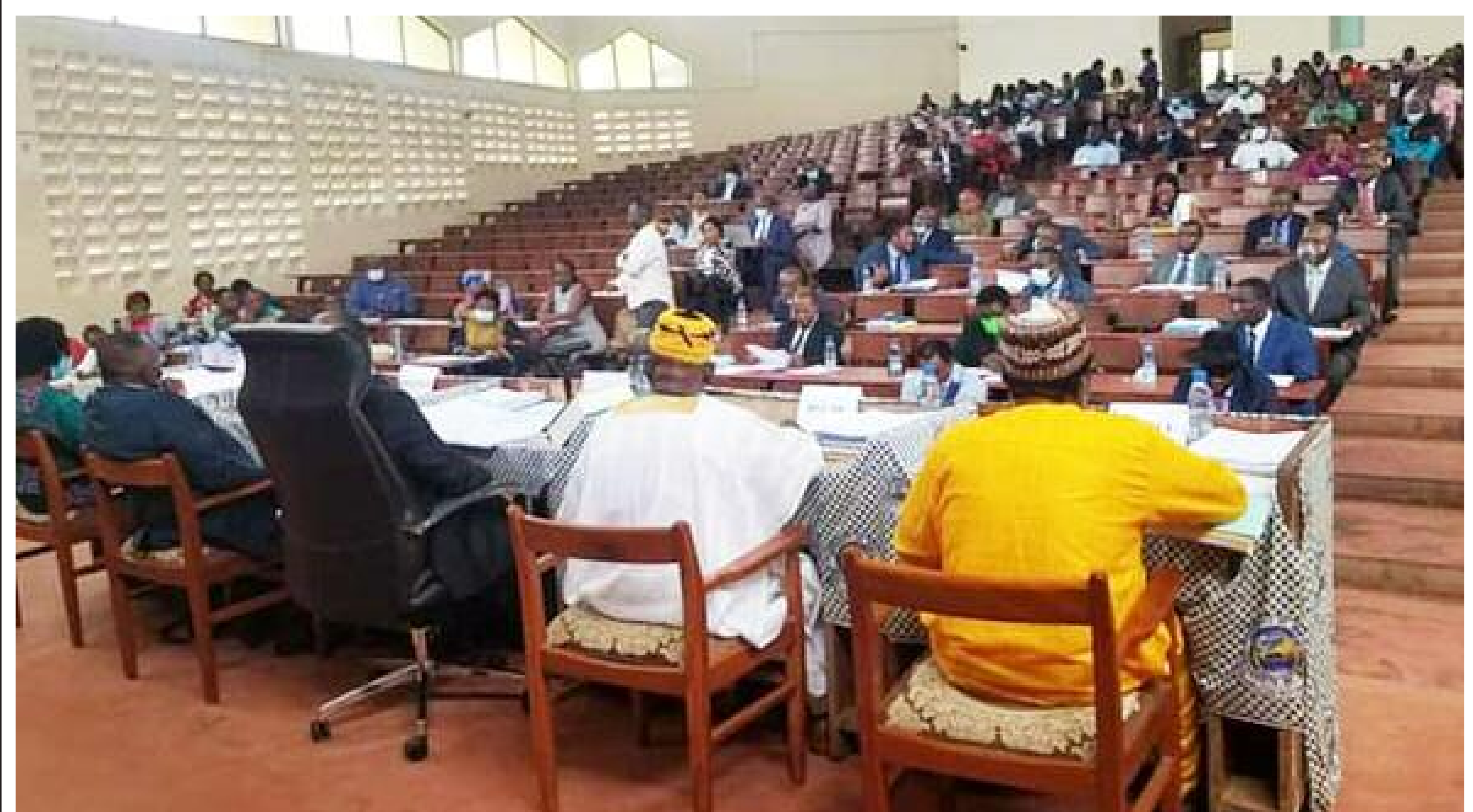
UB officials at Senate meeting

The just-ended academic year at the University of Buea, like in many institutions of learning, provided several challenges. In addition to the already existing security challenged posed by the armed conflict in the North West and South West regions, they also had to deal with the coronavirus.